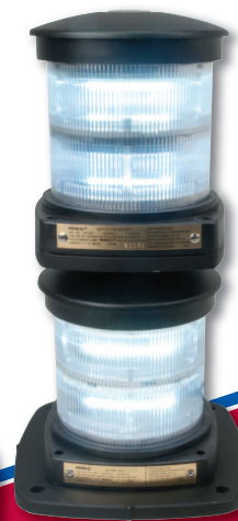
Fig. 1080 All-Round Light

MARINE NAVIGATION LIGHT CERTIFIED TO THE USCG AND '72 COLREGS BY IMANNA LABS IN ACCORDANCE WITH A.B.Y.C. A-1104. FOR USE ON VESSELS 20 METERS TO 50 METERS.