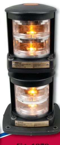
Fig. 1079 Towing Light