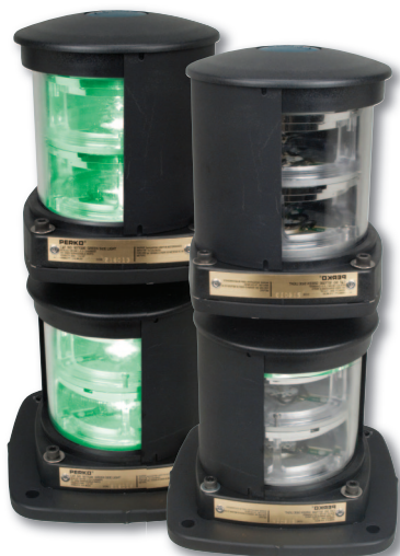
Fig. 1077 Green & Red Side Lights