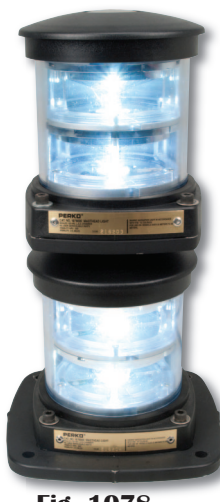
Fig. 1078 Masthead Light