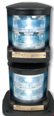
Fig. 1079 Stern Light